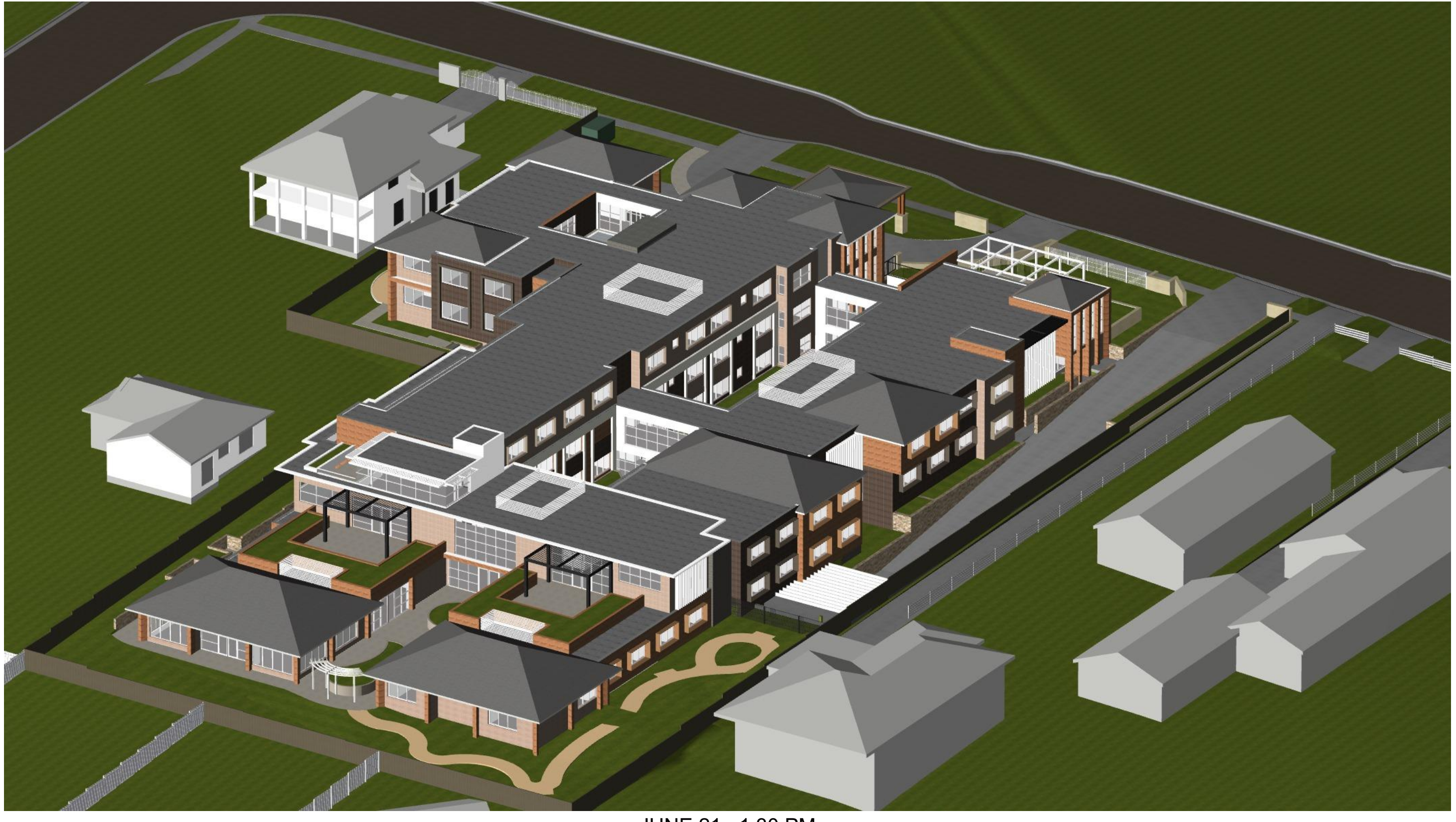
JUNE 21 1:30 PM